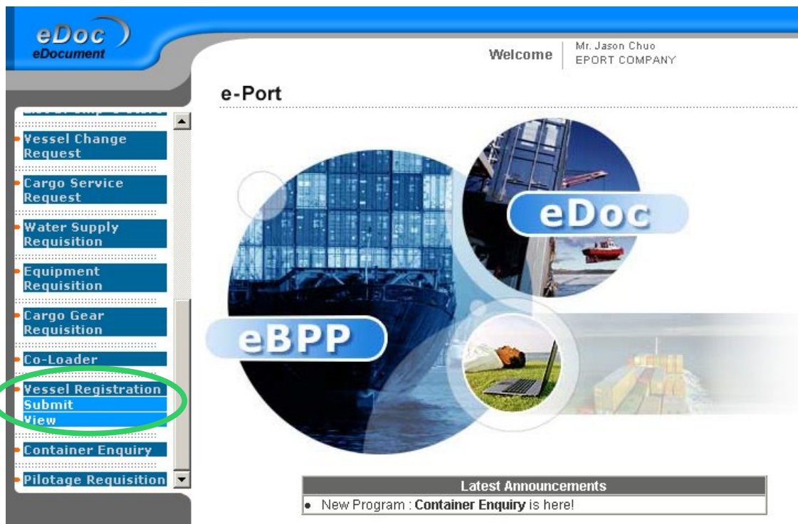
Illustration 1: Menu

To submit an Vessel Registration, locate the Vessel Registration menu on your left side panel.