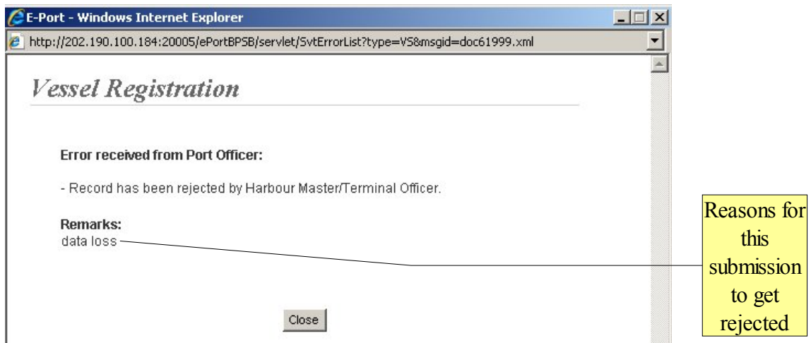
Illustration 9: Reject remarks